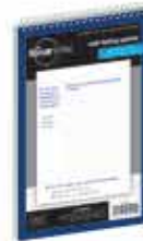
TOPS FocusNotes Steno Book White, 80 Sheets 6" x 9"

Legal pad is great for right- or left-handed note takers. The sturdy back cover holds up to writing on the go, whether you've got a tiny desk space or a mobile meeting. Your pen will love the premium 16 lb. paper.