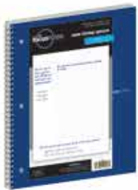
TOPS FocusNotes Notebook White, 100 Sheets 11" x 9"