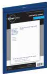
TOPS FocusNotes Legal Pad White, 50 Sheets 8½" x 11¾"

Notebook features a protective cover and spiral binding to keep notes under wraps — ideal for tucking into a briefcase or backpack. It's perfect for lectures and meetings, with superior 20 lb. paper that your pen will love.